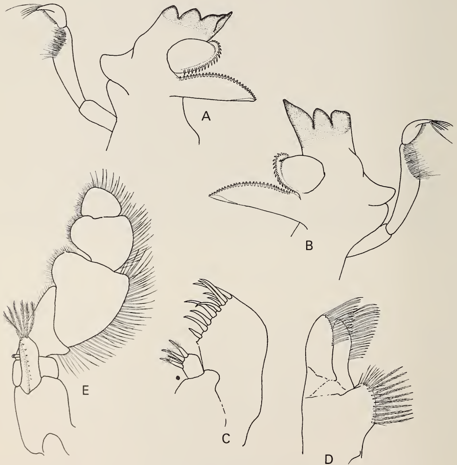
Fig. 2. Parabathynomus natalensis . A. Left mandible. B. Right mandible. C. First maxilla. D. Second maxilla. E. Maxilliped.

Pleopods 2 to 5 similar, with large branchial tuft on peduncle next to insertion of the appendage, plus smaller tuft on outer margin, hidden by longer peduncular tuft; tiny epipodite present; endopod with slender stylet attached